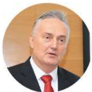
兹拉特科·拉古姆季亚 教授 Prof. Zlatko Lagumdžija

波兰前第一副总理兼财政部长 Former Deputy Premier and Minister of Finance of Poland