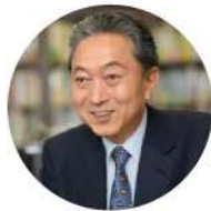
鸠山由纪夫 教授 Prof. Yukio Hatoyama

拉美开发银行前行长 Former President of CAF – Development Bank of Latin America