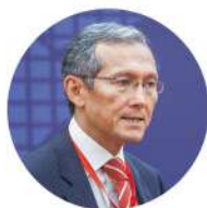
卓奥马尔特·奥托尔巴耶夫 教授 Prof. Djoomart Otorbaev

BRS values expertise. The faculty members are composed of extraordinary leaders and world-renowned experts in political, academic, finance, business management, and other fields whose work influences industry trends and practices.