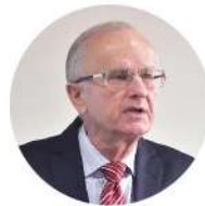
格列戈尔茨·科勒德克 教授 Prof. Grzegorz W. Kolodko

波兰前第一副总理兼财政部长 Former Deputy Premier and Minister of Finance of Poland